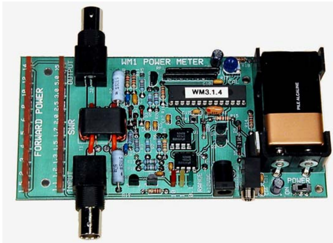
WM1 140W Computing Wattmeter and SWR Bridge

Easy to Build Test Tools and Rig Accessories